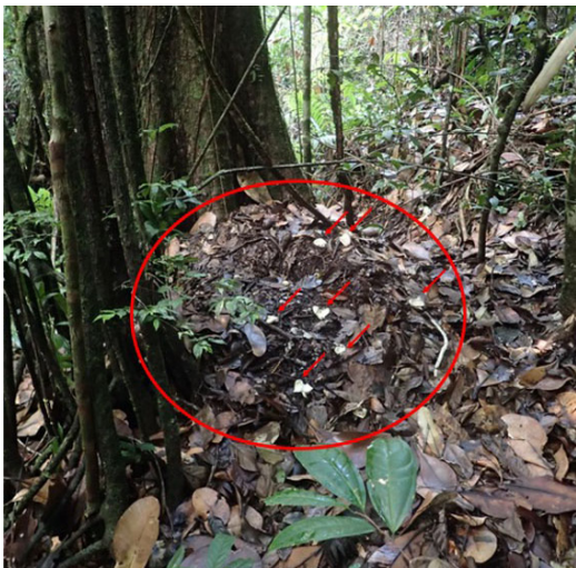
Figure 1. Nest of Paleosuchus trigonatus in the Nouragues natural reserve, French Guiana (4.0667°N, 52.6833°W; Datum WGS84; 20 m elevation). Position indicated by the red circle. Arrows indicate remains of the eggshells.

On the 16 th of November 2017, five meters from the bank where the neonates had been discovered, the remnant eggshells of a recent nest were found. We believe that nest to be the neonates' origin. It was made out of dead vegetation and measured about 140 cm of diameter and nearly 60 cm of height (measured with a tape to the nearest centimetre) and was located adjacent to a big tree (Figure 1). One eggshell was found nearly intact measuring 67.1 mm of length and 41.2 mm of diameter (measured with a calliper to the nearest 0.1 millimetre).